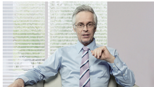
Yealink VC Desktop under 30% packet loss